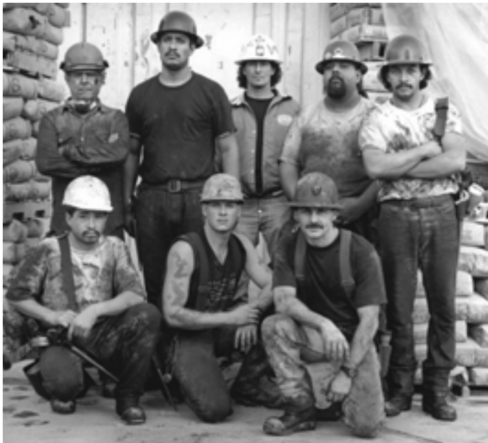
Miners Graveyard Shift Hollywood CA 1994