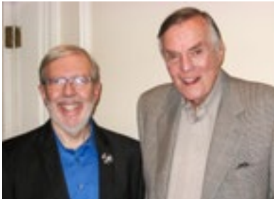
Two previous ART GILMORE Career Achievement Award recipients were on the dais on June 19th. Prolific film reviewer and author LEONARD MALTIN and singer, TV game show host and actor PETER MARSHALL remembered their own celebrity luncheons.